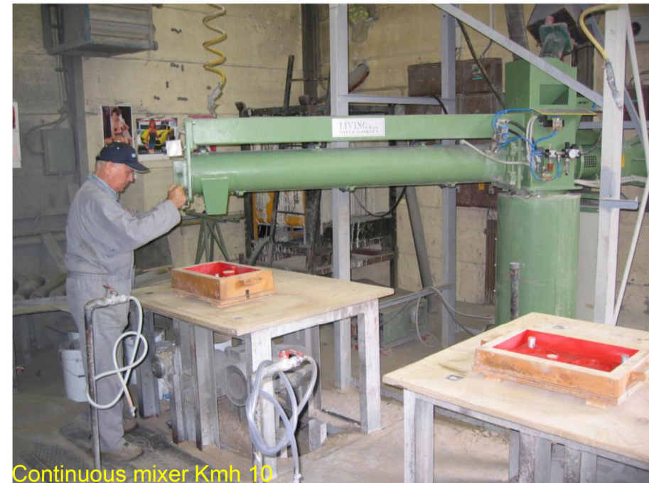
Continuous mixer Kmh 10