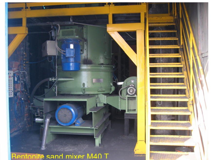
Bentonite sand mixer M40 T