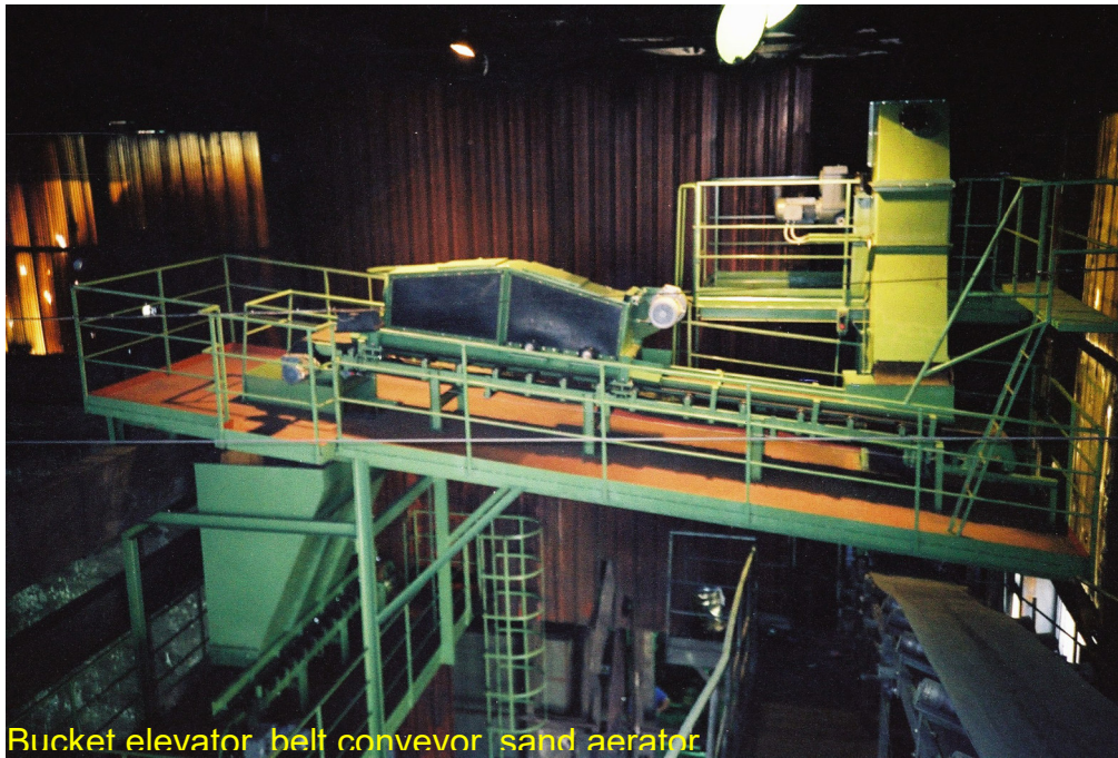
Bucket elevator belt conveyor sand aerator